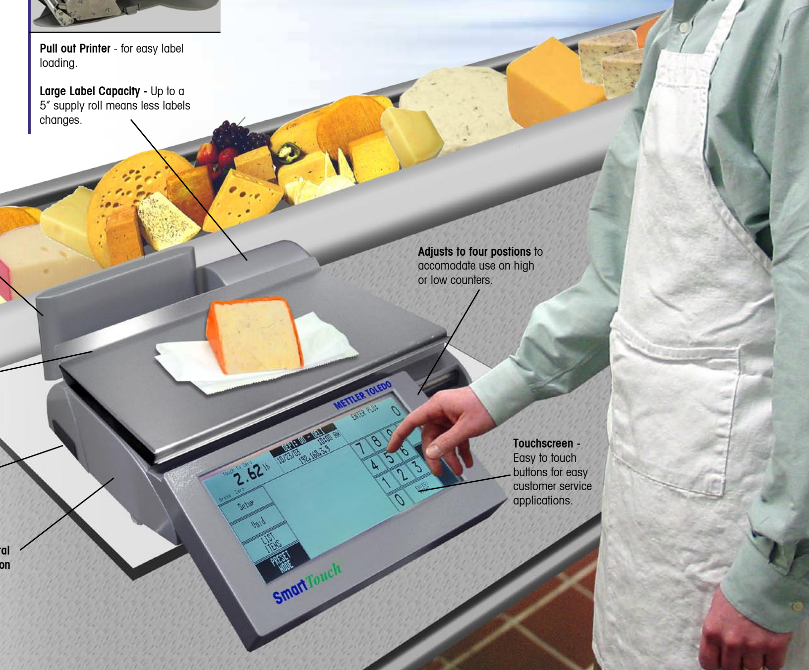
Adjusts to four positions to accommodate use on high or low counters.