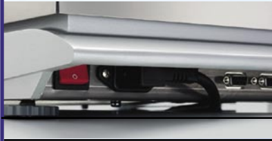
Connections - Convenient Power, Keyboard, Mouse, and Network Connections on the front simplify cabling.