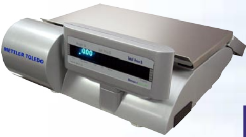
Sleek Low-Profile Design Fits on Any Type of Countertop