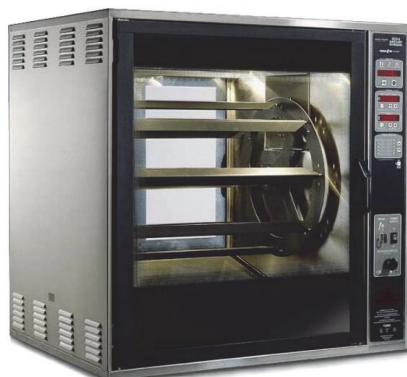
SCR 8 countertop 8-spit rotisserie