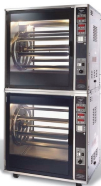
SCR 16 stacked 16-spit rotisserie

The sight, smell and taste of rotisserie chicken can add significant impact and sales to your store. With such a powerful appeal to the senses, choosing your equipment is critical.